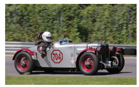
MG TB Special