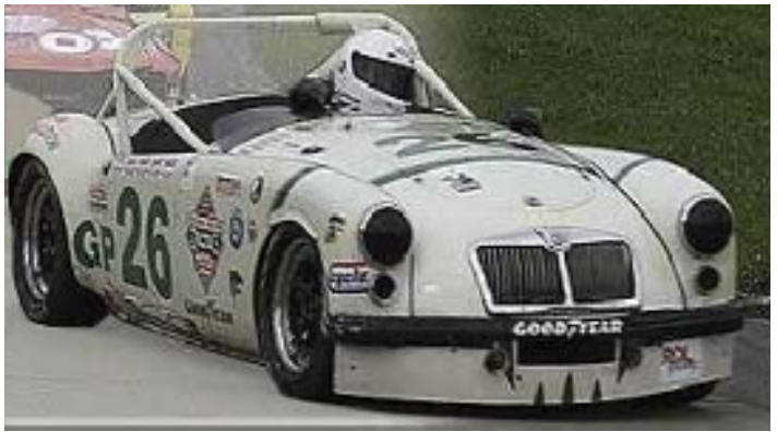
Not eligible : MGA with ineligible modifications: i.e. spoiler, flared fenders, wider than stock wheels, racing slicks, lowered suspension and likely highly modified engine for SCCA racing.