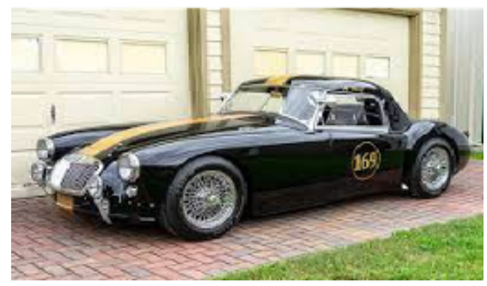
Eligible : MGA with stock body, original sized wire wheels, treaded tires and engine with only period type of modifications.