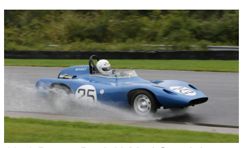
1959 Bunce Buck H-Mod Special