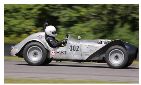
Lester MG Special