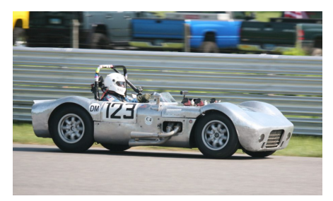
1959 Philson Falcon Special